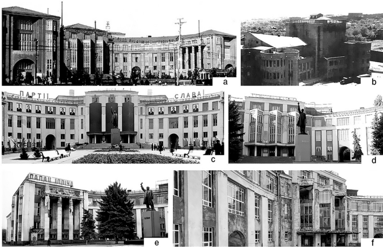
Fig. 1. Photos of “Dvorets Truda” at the most distinctive stages:

a) 1930; b) 1935; c) 1970; d) 2001; e) 2004; f) 2018.